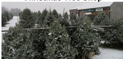
Christmas Tree Shop